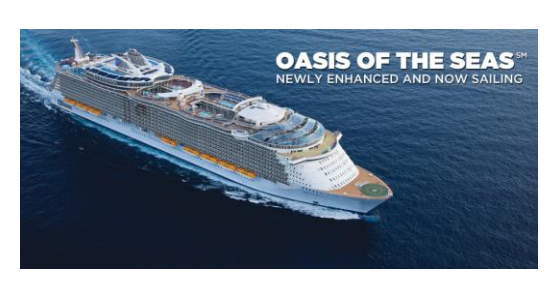
*Crown & Anchor Members may qualify for additional discounts

ASK ABOUT THE 30% off promo ASK ABOUT THE APRIL 3, 2016 BOOK BEFORE to $500 Save up to $500 $1280 PP Double Inside Cabin $1865 PP Double Ocean View Window Cabin $2275 PP Double Ocean View Balcony*